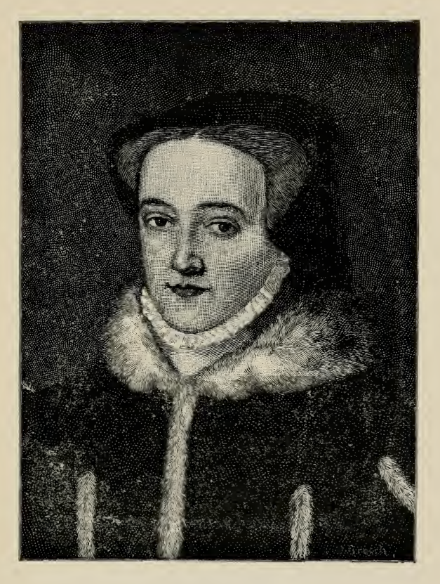
LADY JANE GREY Painting by L. De Heere, National Portrait Gallery, London.