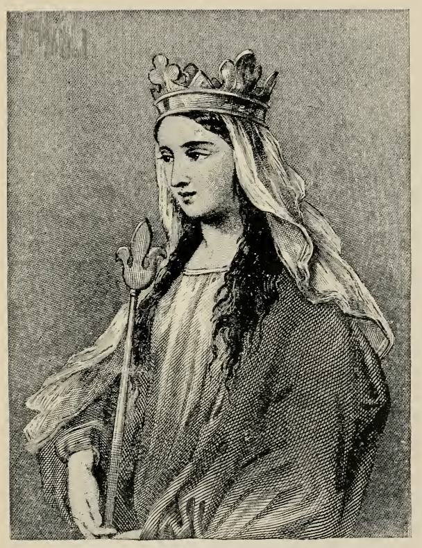
MATILDA OF FLANDERS.