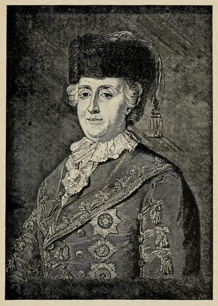
CATHARINE II. OF RUSSIA.