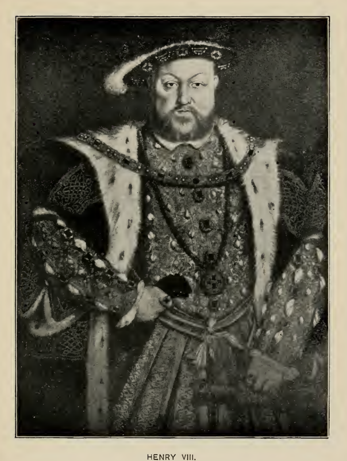
After the painting by Hans Holbein in the possession of His Majesty, the King of England, at Windsor Castle.