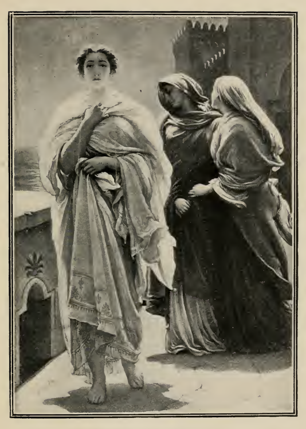
Helen of Troy Lord Leighton

By permission of Henry Graves & Co., Ltd., proprietors of the copyright.