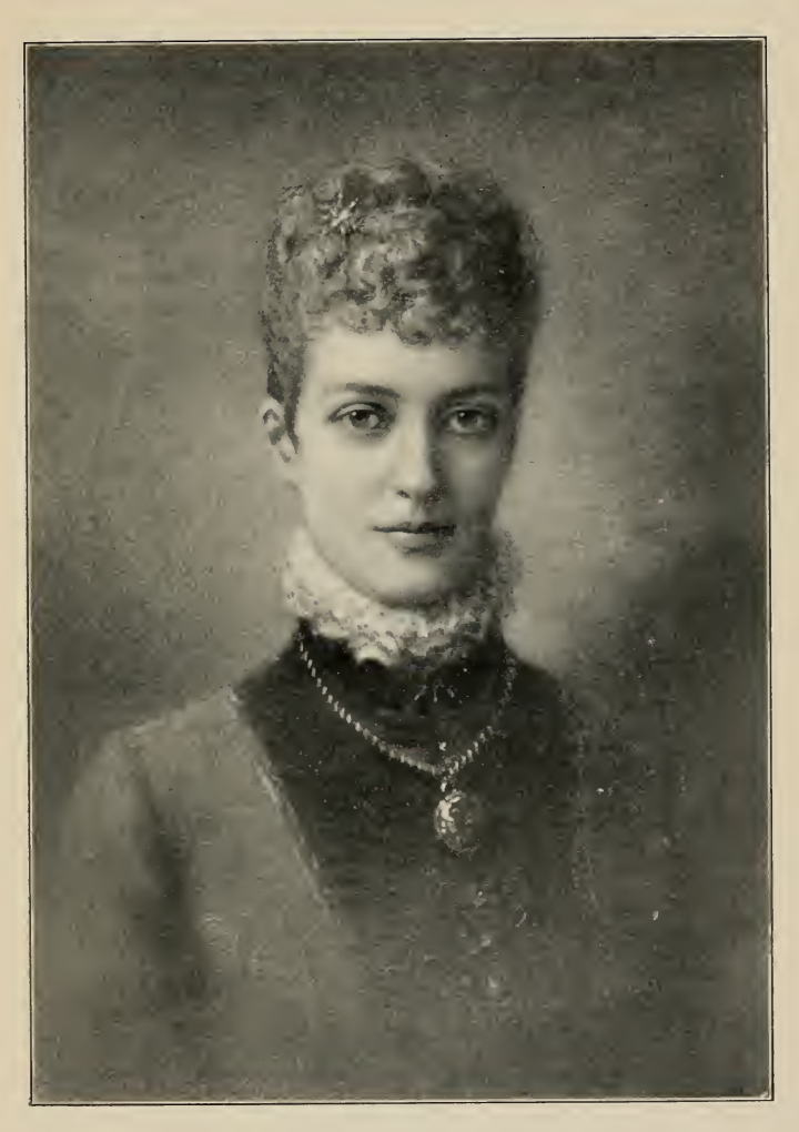
ALEXANDRA, QUEEN OF ENGLAND.